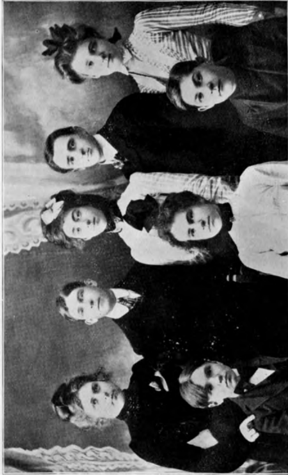
EDITORIAL STAFF OF "THE ORACLE"