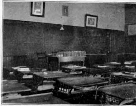
HIGH SCHOOL ASSEMBLY ROOM.