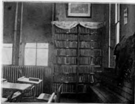
"WHAT A JOY THERE IS IN A GOOD BOOK."

However, the Library contains many works of interest to the general reader, and the privilege of using the books is freely extended to all the people of Bremen, the only stipulation being that they shall receive careful treatment and be returned in due season to the Library.