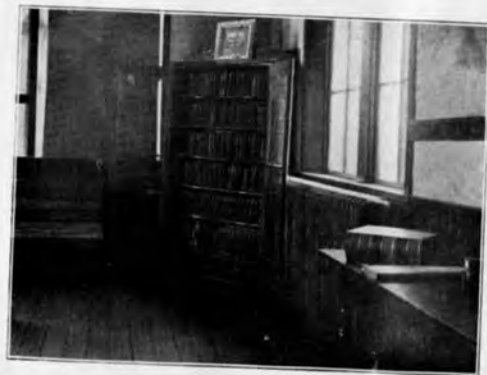
"NOW BLESSINGS ON THE MAN WHO FIRST INVENTED BOOKS."