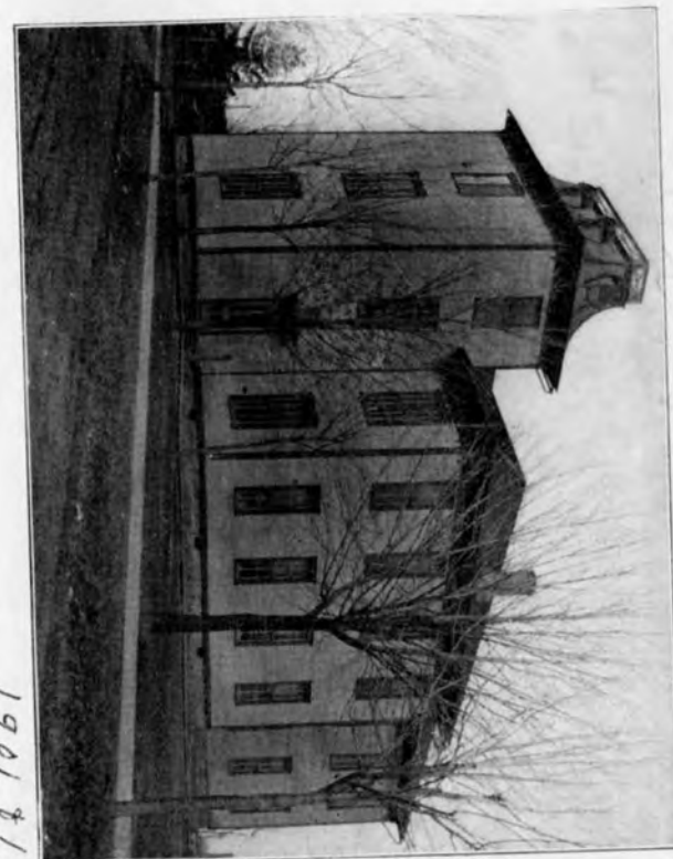
BREMEN PUBLIC SCHOOLS.