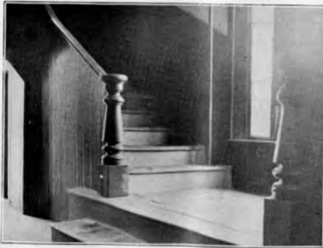
THE GOLDEN STAIRS